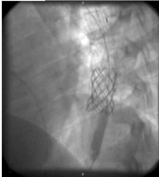
Figure 3: Stent implantation and balloon inflation in one of our patients with native CoA.