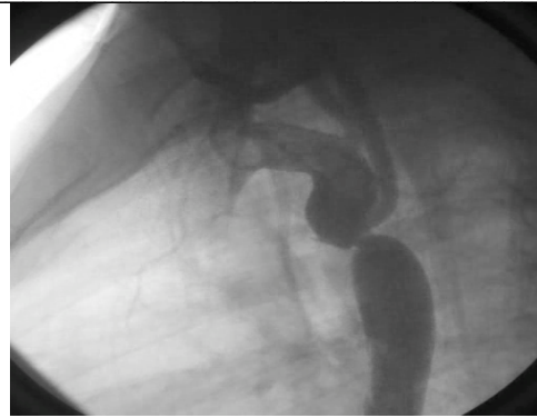
Figure-1:An aortogram in a twelve year old patient showing discrete CoA Catheter interventions

Cardiac catheter interventions were performed under general anaesthesia or conscious sedation. Percutaneous vessel access was achieved in all cases via the femoral artery. Heparin (100 units/ kg) was given after successful arterial access, and repeated after 1 h (50 units/kg). The coarctation was crossed in a retrograde manner with a diagnostic catheter, and peak pressure gradients between the ascending aorta and the descending aorta were measured. Angiography of the coarctation was performed and recorded in the left anterior oblique (LAO 10-20 degrees) and straight lateral projections .The following bilateral measurements were performed : smallest diameter of the coarctation; diameter of the transverse aortic arch; and diameter of the aorta proximal and distal to the site of coarctation. The diameter of the balloon used for dilatation was chosen equal to the diameter of the transverse aortic arch. Dilatation was performed over a period of 10 s. Stent implantation was performed via retro-grade approach using a long sheath, which allowed a proper stent positioning and hand injections of contrast medium during implantation (16). Immediately after balloon dilatation or stent implantation, the invasive residual pressure gradient was measured and angiography was performed.